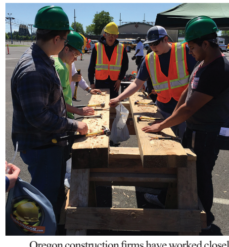
Oregon construction firms have worked closely with state legislators in recent years to get $10 million to $20 million in state funds dedicated to vocational, technical and shop classes in public schools. That has allowed construction to begin a promising

The AGC message is that in the time it takes to earn a college degree, an individual participating in vocational programs or apprenticeships promoted by the construction industry can go directly into high-paying jobs with an abundance of opportunities for career advancement.